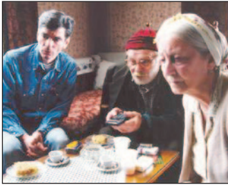
Days and Hours