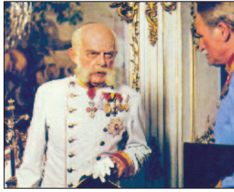
The Day That Shook the World

Can we really ever return from the war? How much stays with