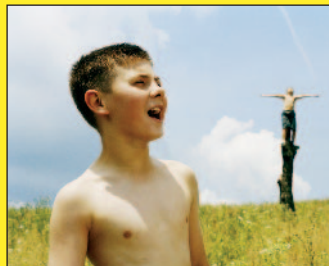
The Way We Played

To stop a German offensive in WW2 the Partisans send an elite team of explosive experts to blow up a strategically important bridge. Besides being heavily guarded, the bridge is almost indestructible. The only man who knows its weak spots is the architect who built it – but he is reluctant to destroy his masterpiece.