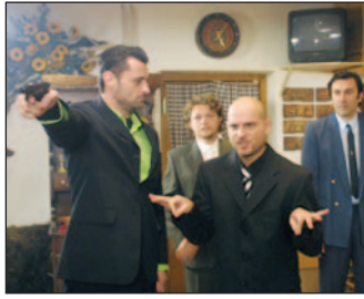
Cheese and Jam

A young Bosnian woman is sold into prostitution in Italy by her brother's best friend in 1992, prefiguring the post-war expansion of sex trafficking in Bosnia.