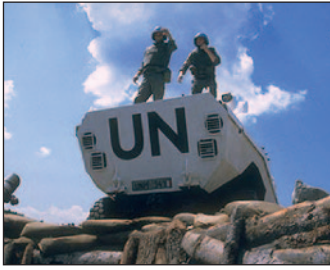
No Man's Land

while a foreign photographer stood by snapping pictures.